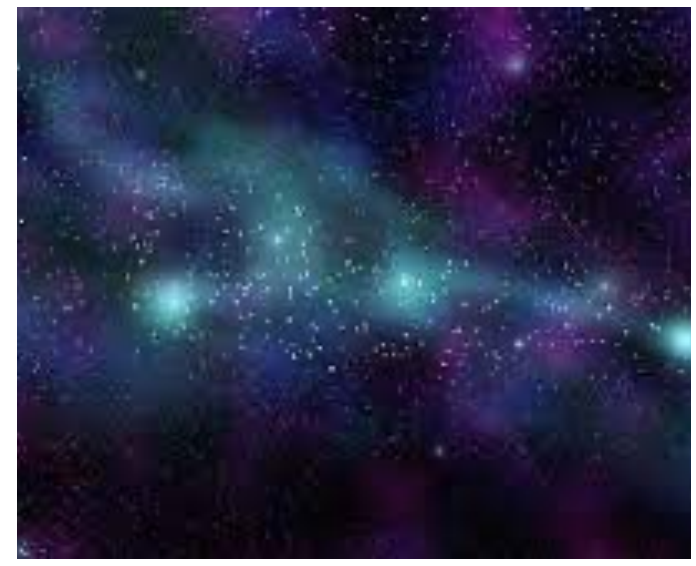
Sky Event Almanacs